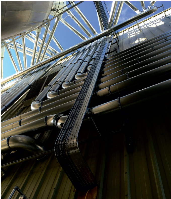
Complex external pipework

A tenfold team of highly skilled pipework specialists with a plethora of project experience install pipework in the shortest possible time to market leading standards.