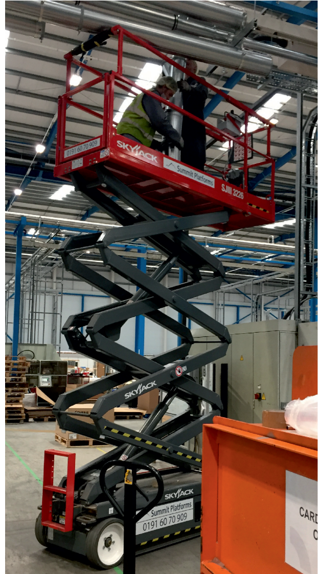
Installation of pipework